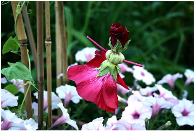
Learn to make your own hollyhock dolls with flowers and toothpicks.