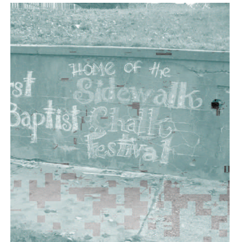
First Baptist held their 6th annual Sidewalk Chalk Festival